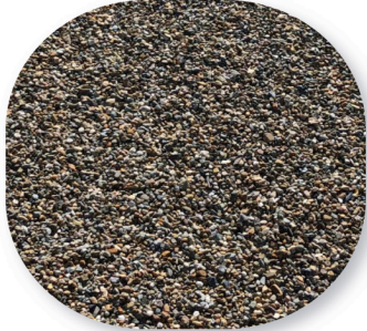
Washed Natural River Stone (Round)