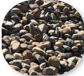
Unwashed Natural River Stone (Round)