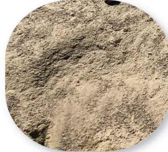
Washed River Sand